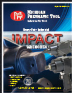
Heavy-Duty Industrial Impact Wrenches