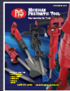
Construction Air Tools