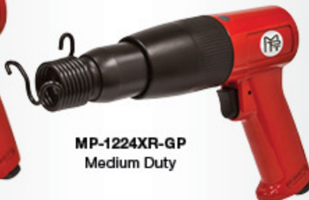
MP-1224XR-GP Medium Duty