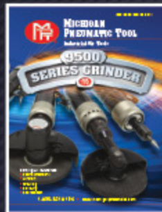
9500 Series Grinders