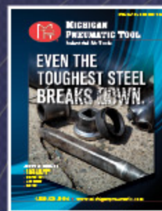
Rivet Buster Sleeve Wear Flyer