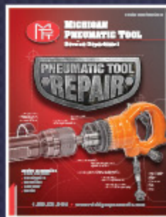
Pneumatic Tool Repair