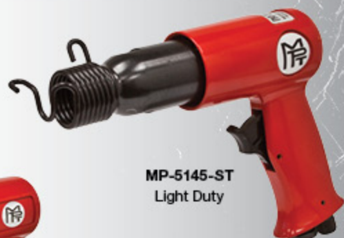
MP-5145-ST Light Duty