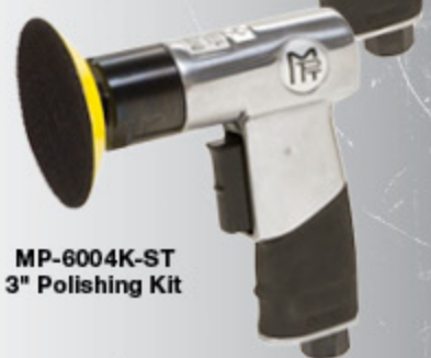
3" Polishing Kit