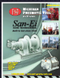
Winches & Material Handling