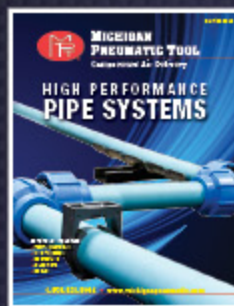
Compressed Air Pipe Systems