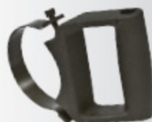
#2080-A48 Optional Dead Handle