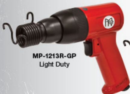
MP-1213R-GP Light Duty

This family of air hammers feature cast aluminum handles for rugged applications, light chipping, casting and foundry applications. Four sizes to choose from depending on your application. Quick change retainer springs included.