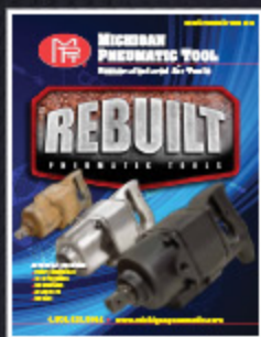
Rebuilt Pneumatic Tools Flyer