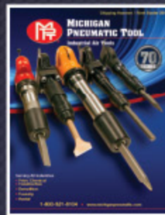
Chipping Hammer & Rivet Busters